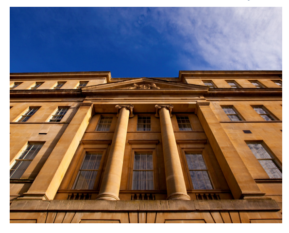
11:15 - Meet at The Gainsborough Bath Spa

On Sunday, a representative from Thermae Bath Spa will talk about the historic nature of the Cross Bath and its contribution to the wellness of Bath's residents over the years.