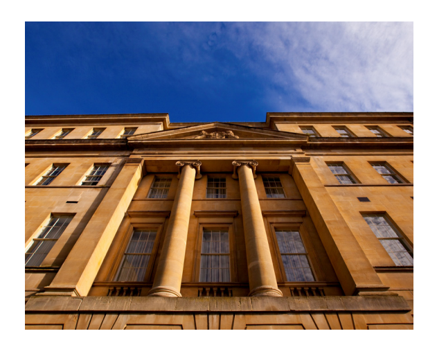
13:45 - Meet at The Gainsborough Bath Spa